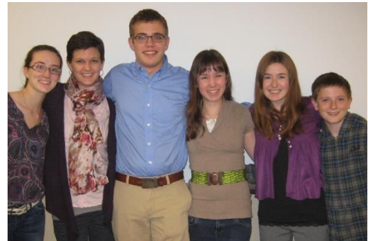
Carmel Green Teen youth board

The Carmel Green Teen Micro-Grant Program is a youth-directed program that awarded small grants (up to $1000) and provided technical guidance to young people for their youth-led environmental sustainability projects in Carmel, Indiana. The program utilized middle and high school students to inspire and mentor youth, ages 19 and under, to identify environmental needs within the community and to design, fund, implement, and evaluate appropriate projects to address those needs. Created, developed, and administered by teens, the program's goal was to challenge area youth to use their skills, creativity, and energy to help make our community greener. Through facilitating youth-driven projects that reduce pollution, conserve natural resources, reintroduce native species or habitats, or save energy, the program empowered young people to take positive action.